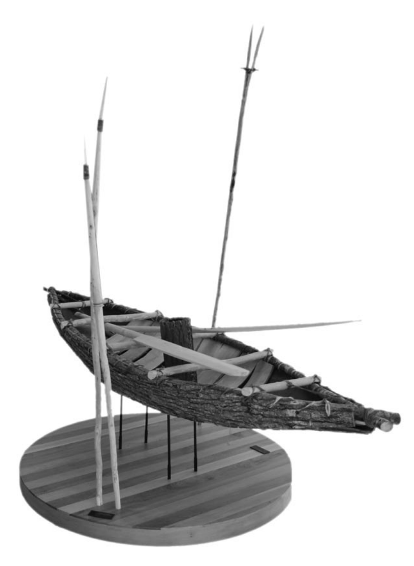
Facsimile of Yaghan Canoe Produced by Martin Gonzalez, Chile, 2007

7,000 to 5,000 years BP, testifying to the fact that since early times man has hunted marine mammals, captured birds, fished and collected mollusks. Different evidence (environmental reconstruction, ethnological data) collected at these sites clearly suggests an economy based on marine predation. Dwellings were built on the beach, probably just above the high tide line.